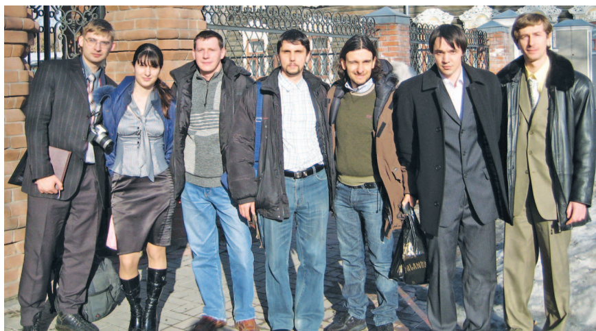
Members of the Tomsk joint MTT/AP/COM/ED/EMC Chapter.

Digital Object Identifier 10.1109/MMM.2009.933579