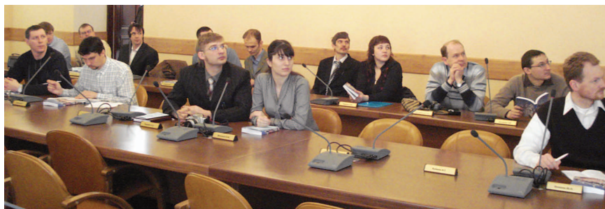
Attendees of the Siberian Conference on Control and Communications (SIBCON), which was held in Tomsk, Russia, 27–28 March 2009.

Tomsk, the ancient town of Siberia, witnessed many exciting events in Russian history and still plays a very important role in its scientific and cultural life. The conference banquet was held in the beautiful Scientific Palace, located in the historical part of the city. The participants had the opportunity to enjoy the historical sites as well as the beauties of